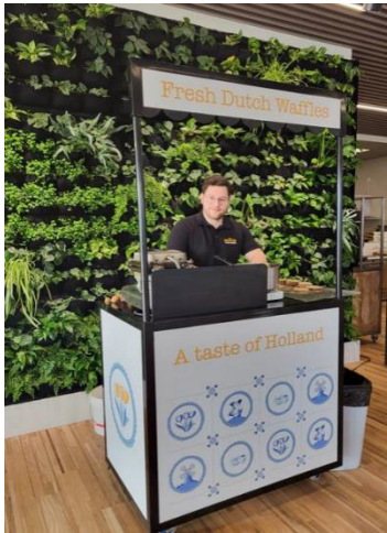
Stroopwafel Unit & Staff – Mock-up

Treat participants to a classic Dutch stroopwafel during the event.