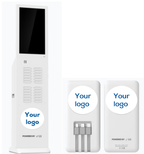
Power banks station

Charge your electronic devices on-the-go