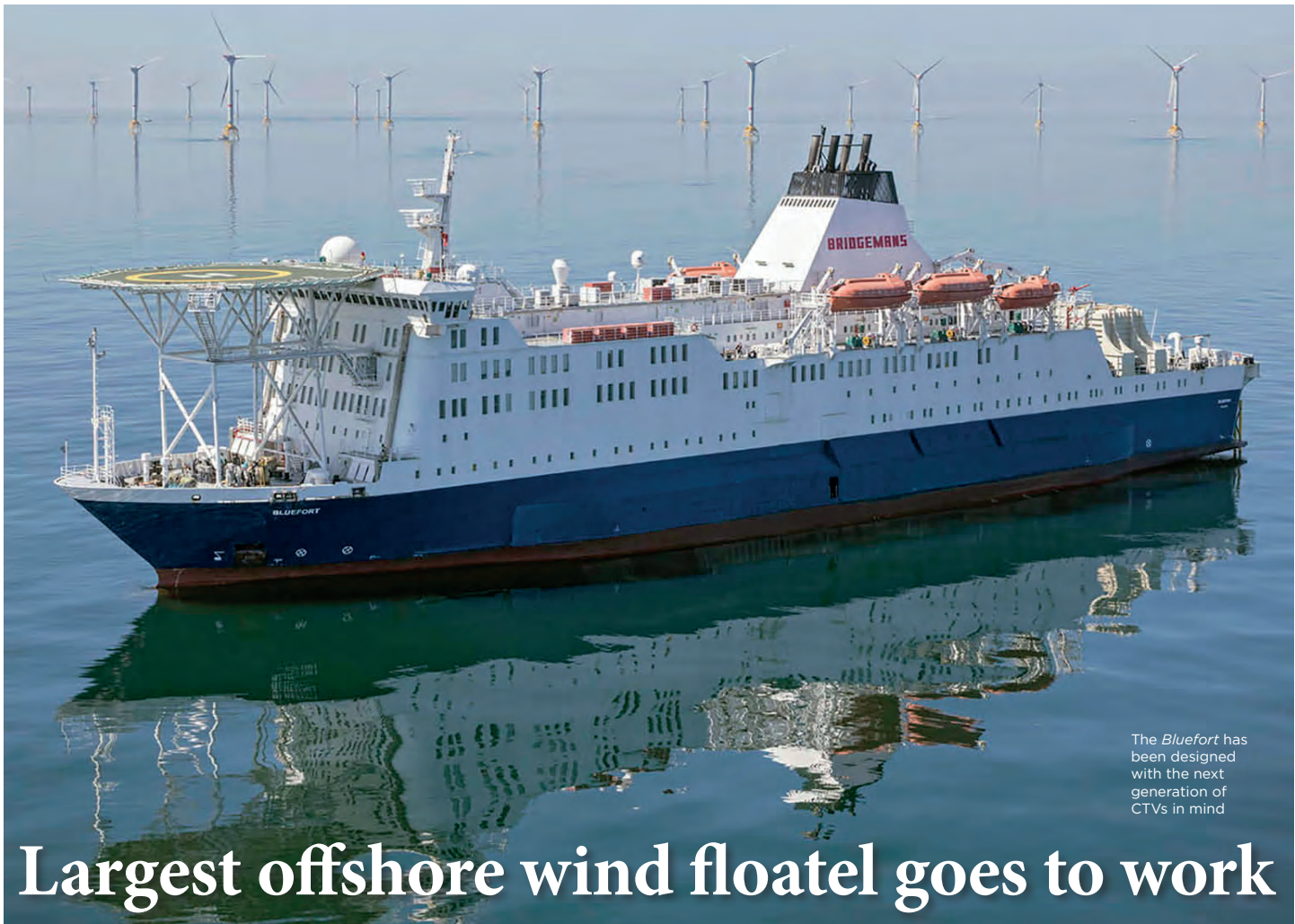
The Bluefort has been designed with the next generation of CTVs in mind