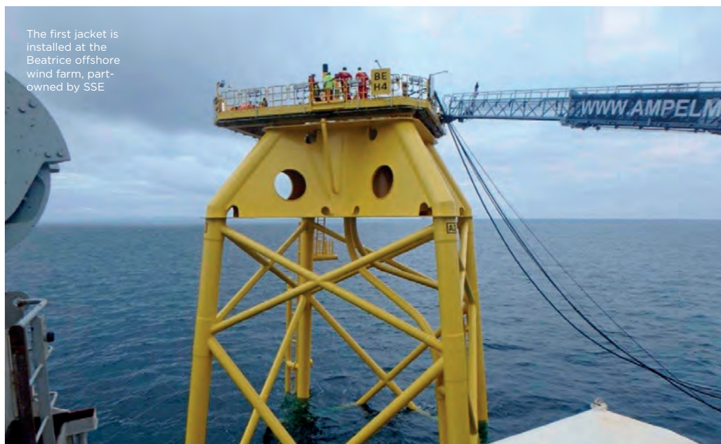
The first jacket is installed at the Beatrice offshore wind farm, part-owned by SSE