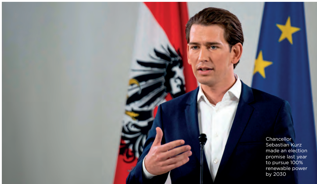
Chancellor Sebastian Kurz made an election promise last year to pursue 100% renewable power by 2030