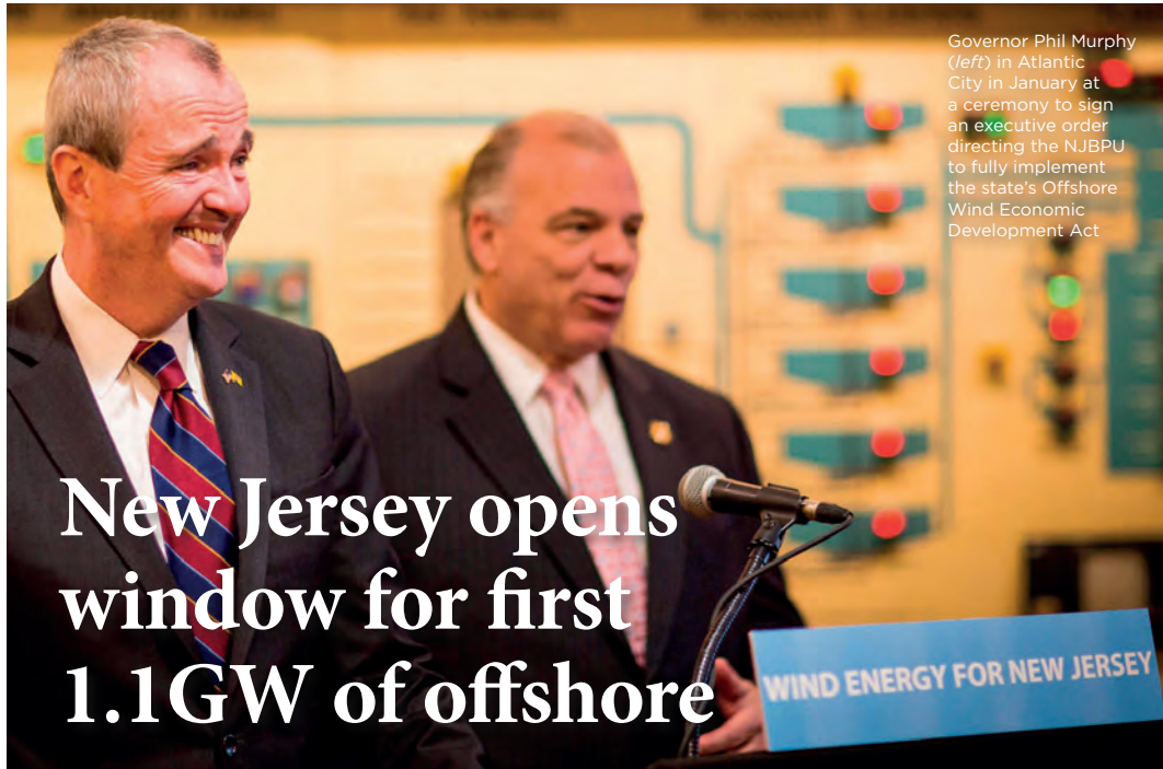
Governor Phil Murphy (left) in Atlantic City in January at a ceremony to sign an executive order directing the NJBPU to fully implement the state's Offshore Wind Economic Development Act