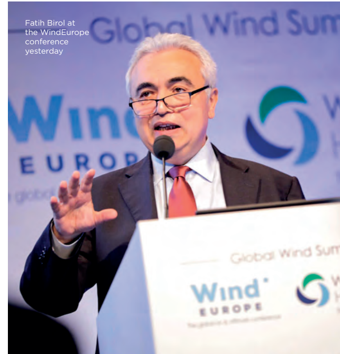
Fatih Birol at the WindEurope conference yesterday

“The developments in Europe can spark a wave of offshore wind appetite outside of Europe — there's some fertile grounds for that,” he said. “First of all Asia, with China followed by