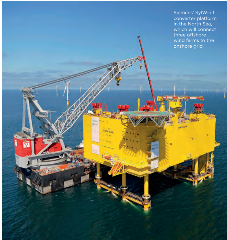
Siemens' SylWin 1 converter platform in the North Sea, which will connect three offshore wind farms to the onshore grid

With this goal in mind, the solution should focus on how to realise this energy transition in the most cost-effective way. This requires efficiently using the costly infrastructure and — most likely — hybrid connections that combine offshore wind with interconnection capacity. According to the North Sea Wind Power Hub consortium, significant cost savings can be realised for society when an internationally coordinated roll-out is pursued in which individual projects are tied together in offshore hubs, rather than the current radial