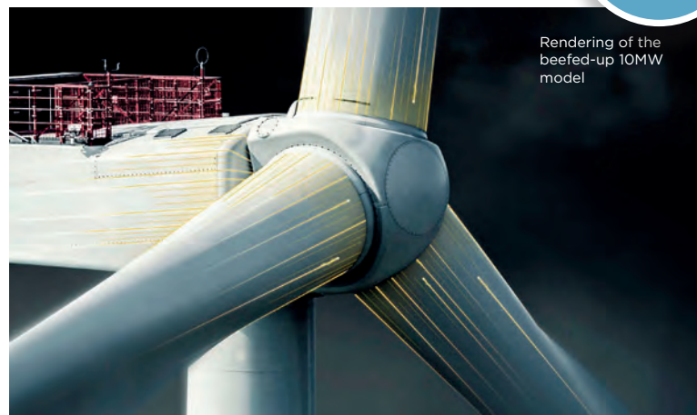
Rendering of the beefed-up 10MW model

run at full power in wind speeds of 10 metres per second, and last for 25 years, will be able to power the equivalent of almost 6,000 European homes.