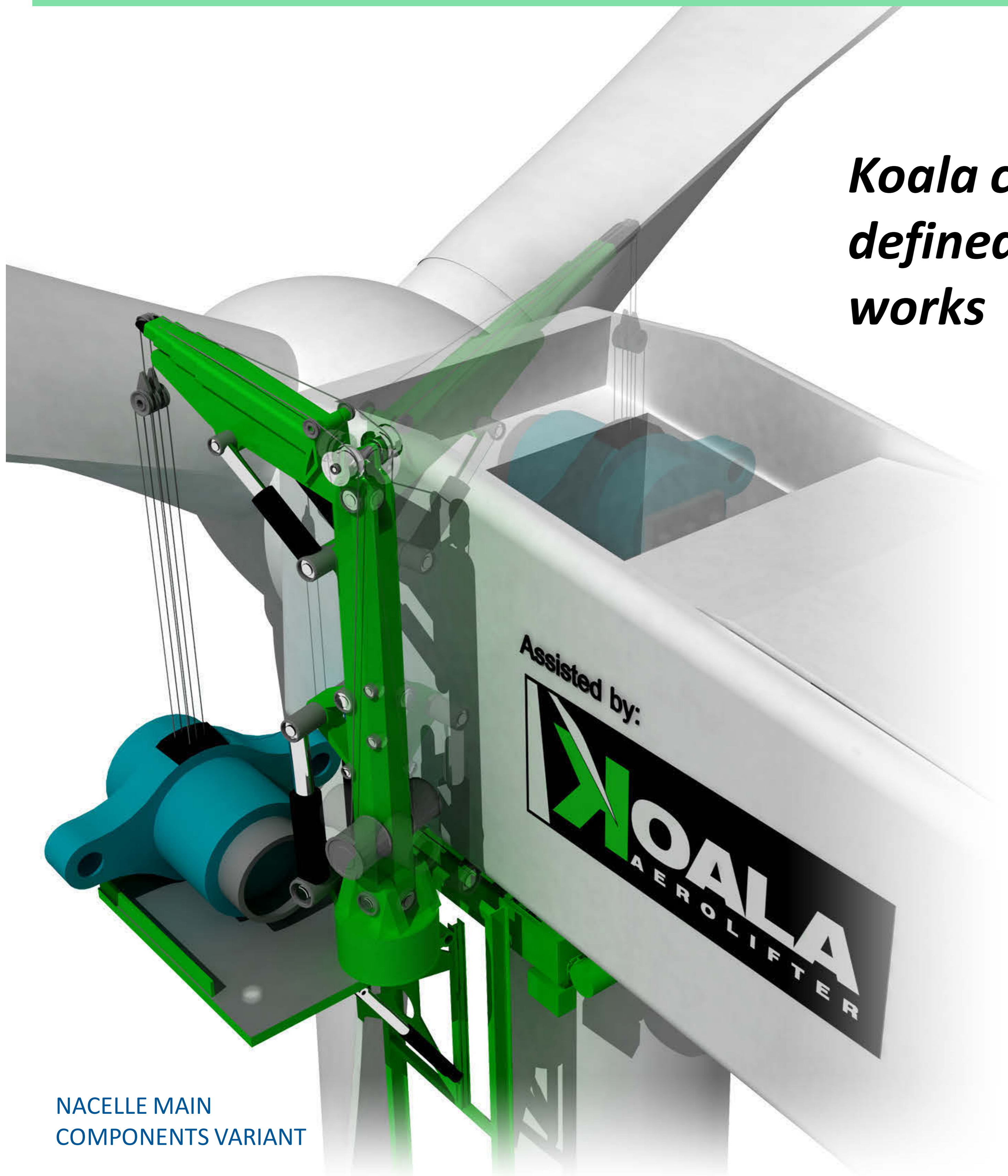
NACELLE MAIN COMPONENTS VARIANT

Koala shares the major component transportation truck