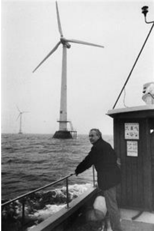
1. Era: Wind turbines at sea...